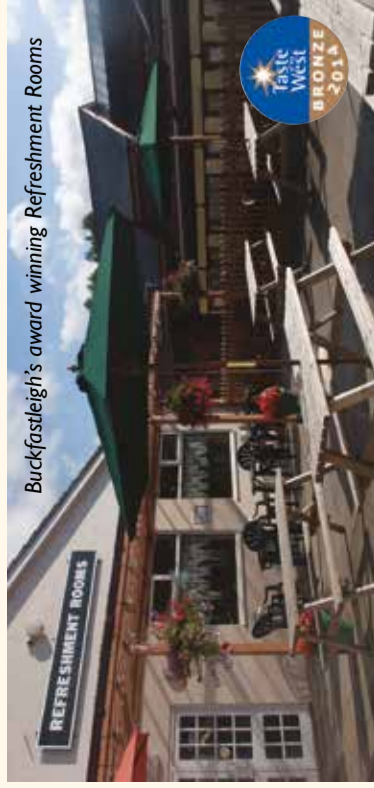
Buckfastleigh's award winning Refreshment Rooms

* Under normal circumstances, all trains are steam hauled, unless marked otherwise when vintage diesel traction is used.