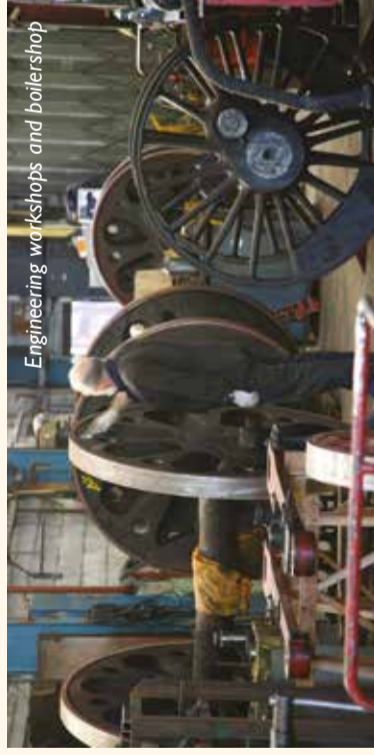
Engineering workshops and boiler shop