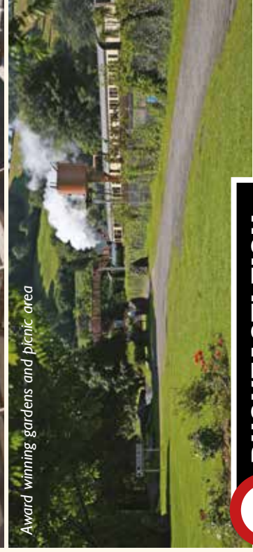
Award winning gardens and picnic area