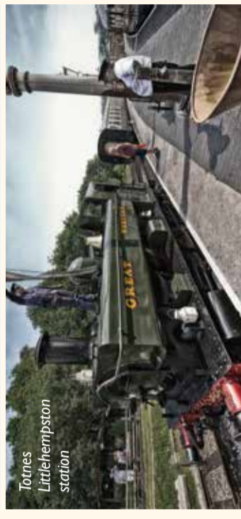
Totnes Littlehempston station

At Totnes, there is a less than 500 yard walk from the main line station and there are footpaths and cycleways from Totnes' famous town centre. While at our station, visit the award winning Totnes Rare Breeds Farm (joint tickets available). Enjoy something to eat and drink at their coffee shop. The River Rat ferry service runs to Totnes on certain days (check at Totnes Littlehempston station for details).